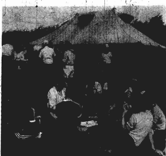
LUNCHEBREAK...Over 200 athletes, as well as numerous volunteers, took a break for lunch during Saturday's track and field events at Century Field. Lunch was provided by the Parkland Lion L's who made over 750 sandwiches for the athletes.

for the second best, in descending order to one point for the lowest score.