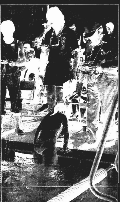
SWIMMING BIG PART OF EVENT