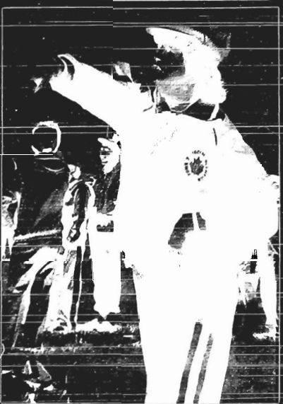
ATHLETE EAGER FOR BEST THROW