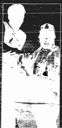
READY TO COMPETE