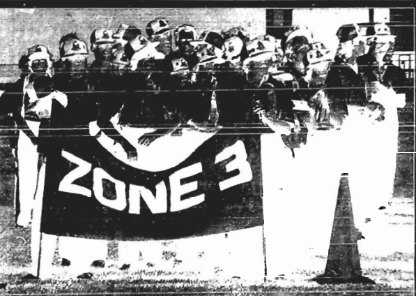
ZONE 3 (AREA) ATHLETES SHOW THEIR UNITY