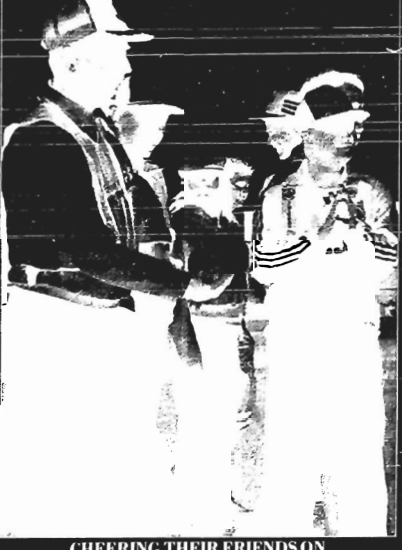
CHEERING THEIR FRIENDS ON