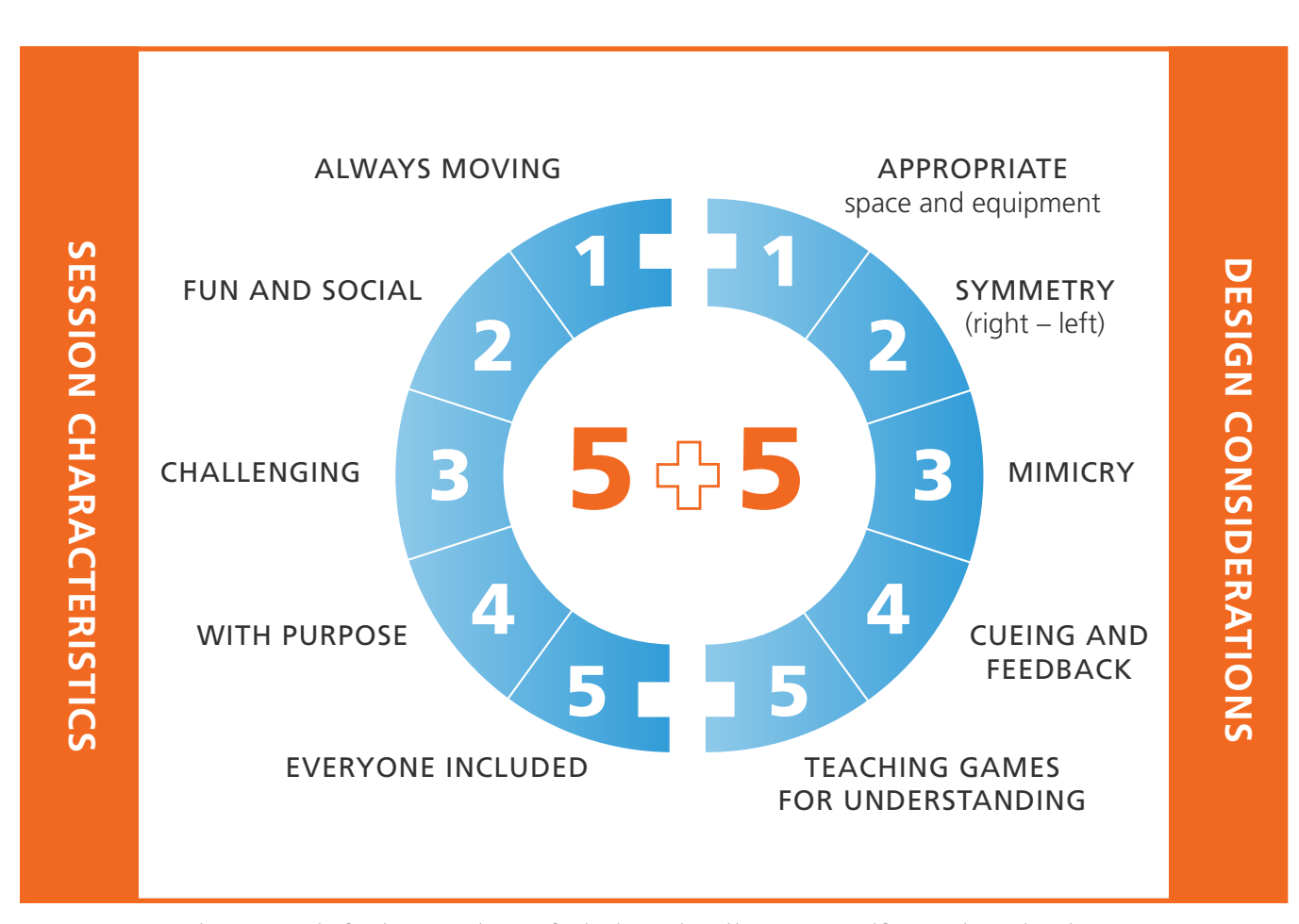
Figure 5: Five session characteristics plus five design considerations for developing physical literacy. Extracted from Developing Physical Literacy 2.0, pg 19, ©Sport for Life

In this framework there is a clearly defined role for multi-sport involvement and its contribution to the development of physical literacy and sport specific goals and the athlete's sport calendar and participation. This framework also outlines the fluidity between the various experiences.