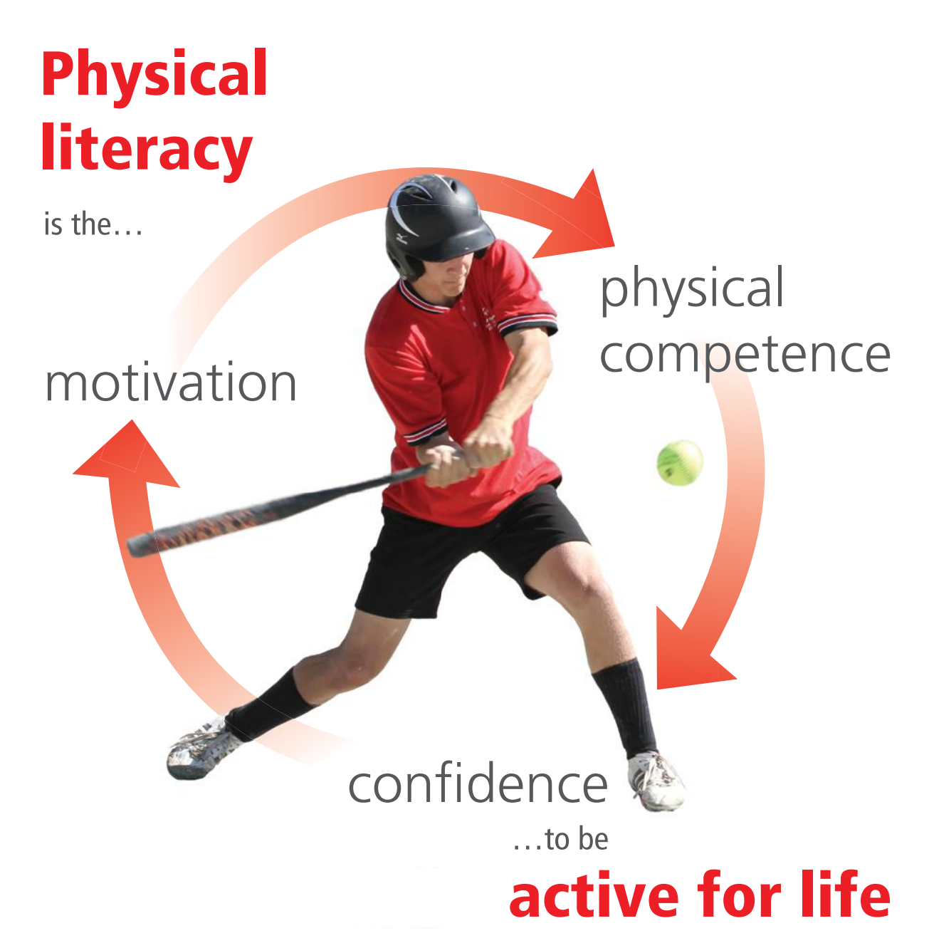
Figure 2: Physical Literacy Wheel

Adapted from Sport for Life's Developing Physical Literacy: Building a New Normal for All Canadians.