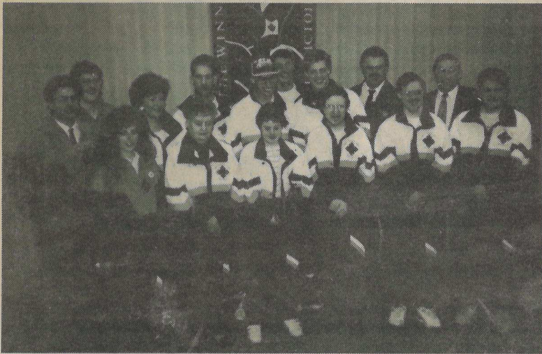
Members of the Special Olympics team, Saskatoon contingent, at a press conference in March 1993, with their coaches and medical team.

Better yet, why not sponsor an athlete to compete in the games? I am certain you can find athletes in your local communities who are more than willing to have the opportunity to compete on the same track as these international Grand Prix athletes.