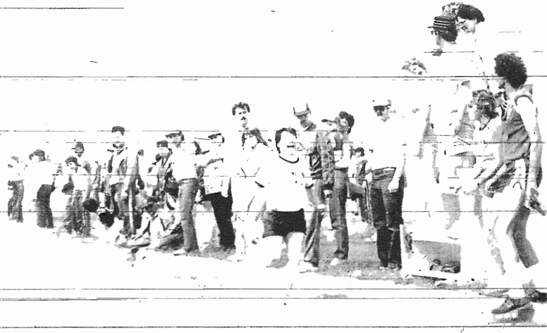
A final burst of effort by the anchor leg runner in the team 4x100 relay brought a second-place finish to the Zone 4 team.