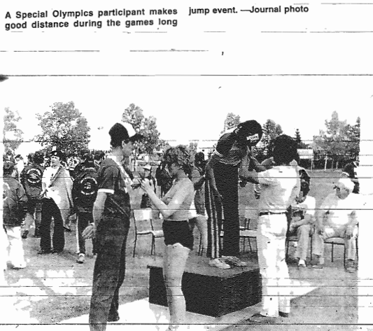
Event winners receive their Special Olympics ribbons.