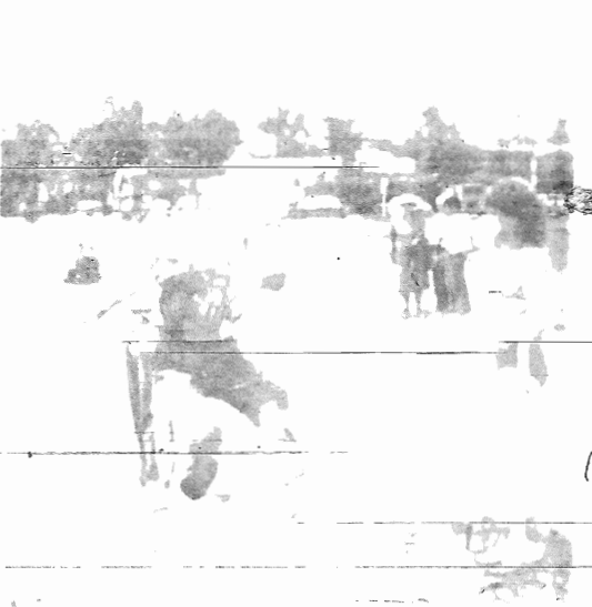
A Special Olympics participant makes good distance during the games long jump event.