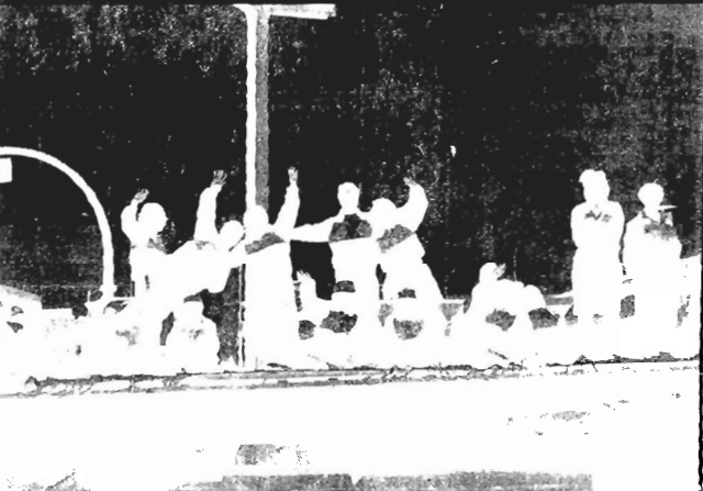
The Saskatchewan Special Olympics featured a parade through downtown Estevan last Saturday morning, and athletes from all eight zones were put on display thanks to semi-trailer

was obviously immersed in the thrill of competition, and the end result drew considerable admiration from the crowd.