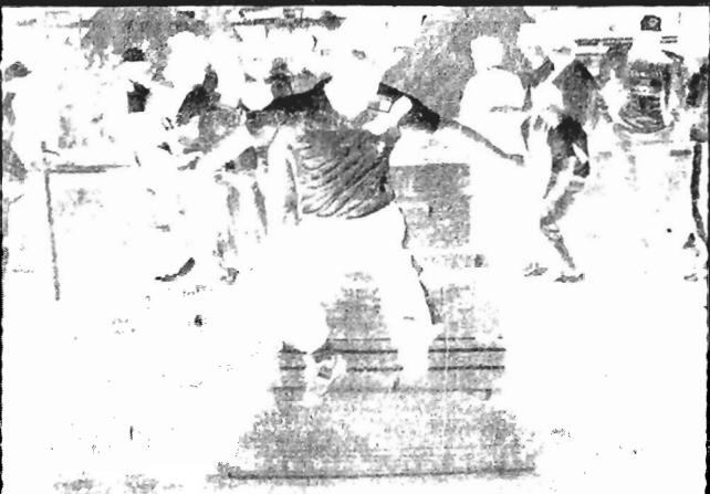
Long jump was just one of the many events staged at the Saskatchewan Special Olympics on Saturday at the Estevan Comprehensive School's track facility. This prospective jumper

Comprehensive School. Smiling athletes were everywhere and the feeling was certainly contagious among the spectators.