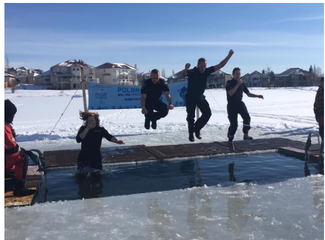
Calgary Polar Plunge