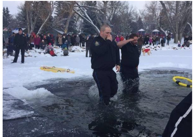
Lethbridge Polar Plunge

albertatorchrun.ca/wordpress/?post_type=event