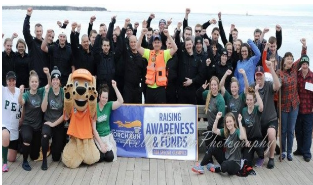
2017 Polar Plunge—Summerside Location